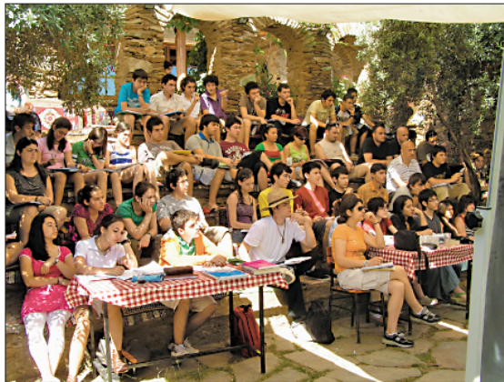
Students and teachers listening to a lecture in an open-air theater.

interests but also preparing the ground for cooperation between colleagues in the same or related fields. This year, for example, the second and third weeks saw courses called Reflection Groups, Introduction to Classical Groups, Fundamental Groups, and Three Groups Every Mathematician Has to Know. The range of subjects is too wide to cover here, but university students can learn about anything from Lie algebras to Fourier analysis, from measure theory to representation theory of groups. Some classes can be said to be interdisciplinary between mathematics and philosophy, physics, or computer science, such as Recursion Theory, Gödel's Incompleteness Theorem, or linear programming.